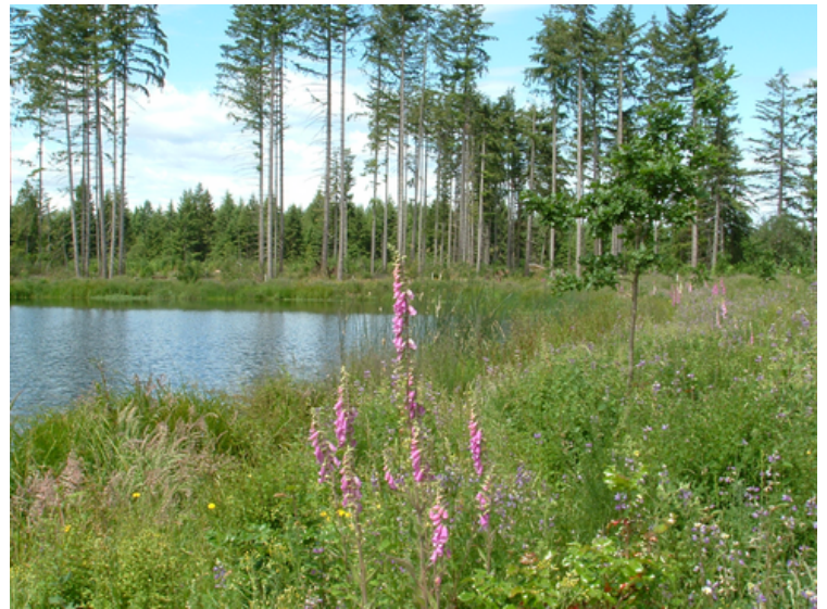
Hawks Prairie Pond