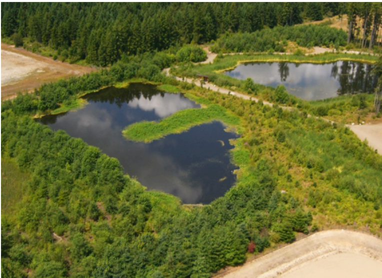
Hawks Prairie Ponds and Recharge Basins